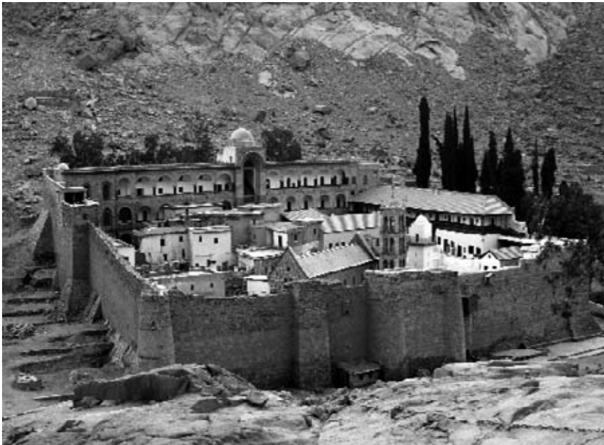
4. The Monastery of St. Catherine.