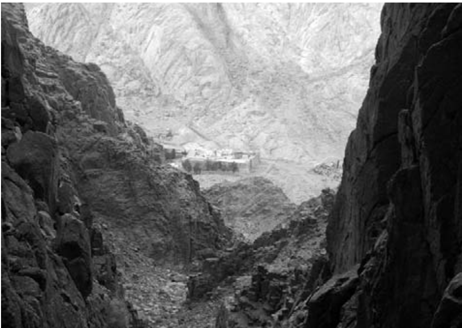
3. The Monastery of St. Catherine from the path descending from Mt. Sinai.