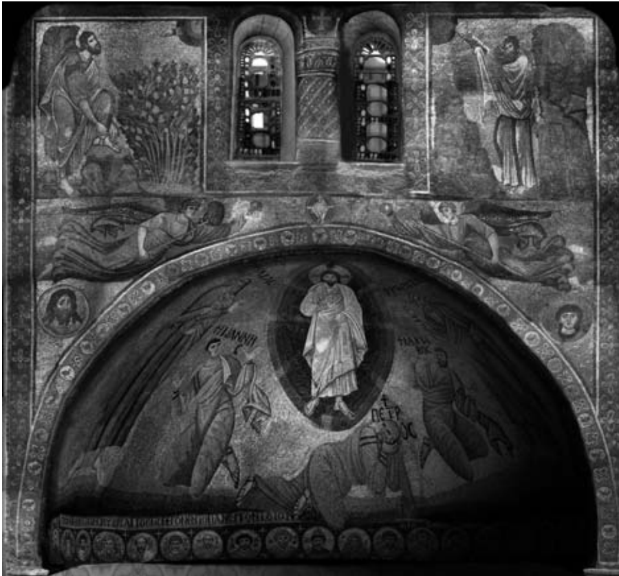
8. The mosaic of the Transfiguration with the apse and the arch.

More than half a million small tesserae were used to cover the forty-six square meter surface of the apse area and the triumphal arch of the church, an average of 11,700 pieces per square meter. The tesserae are mostly glass paste, cut into cubes that average five to seven millimeters on each side. Natural stone was used only for the flesh tones, with delicate gradations ranging from rosy-white to bright pink and orange. Compared to stone, the glass paste tesserae were a precious material because they had to be made by hand.