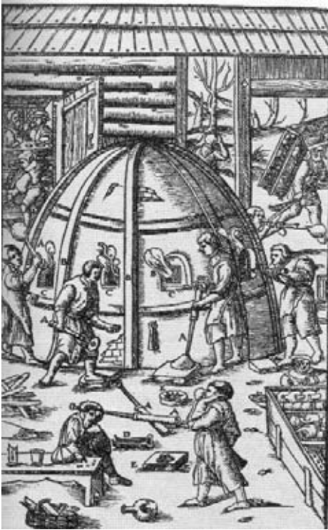
9. The manufacturing of glass in a sixteenth century representation. (Agricola 1556)

Given their lightness, glass paste tesserae were particularly suited to cover vaulted surfaces without weighing down the structure. The great variety of colors and the brilliance coming from light refraction made glass tesserae an ideal artistic medium for transforming architecture into evanescent surfaces where the space is filled with expanses of color and luminosity. It is a space that changes with every variation in the ambient lighting.