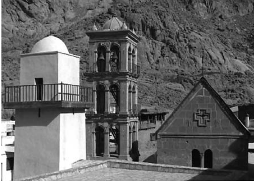
5. The basilica, the bell tower, and the minaret of the mosque inside the Monastery of St. Catherine.