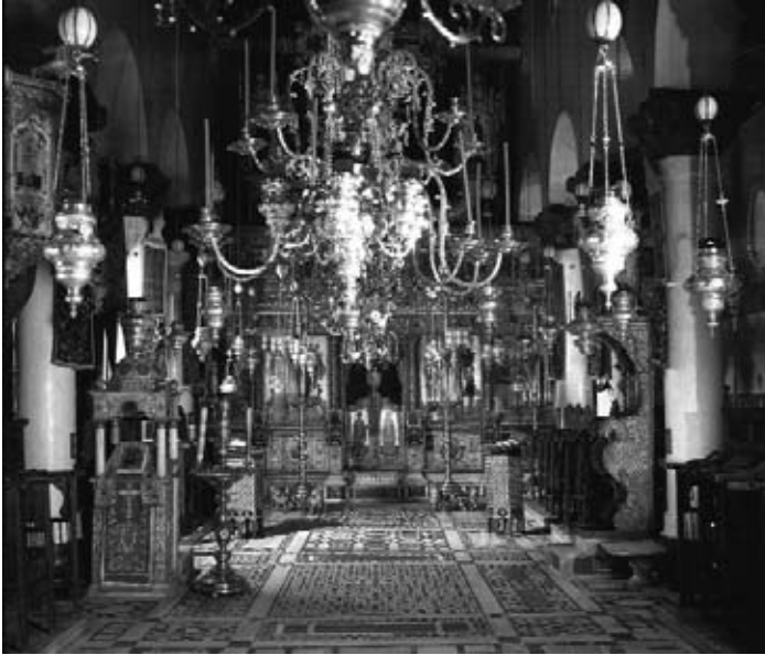
6. An internal view of the church of the Monastery of St. Catherine.

This concept led the Monastery and the CCA to implement some initiatives to inform the public about what is going on behind the scaffolding that will hide the Transfiguration during the work. A full-size image of the mosaic has been installed in the apse of the church; information points have been set up along the access route to the monastery, where visitors can watch videos of the work in progress; and, this booklet has been printed.