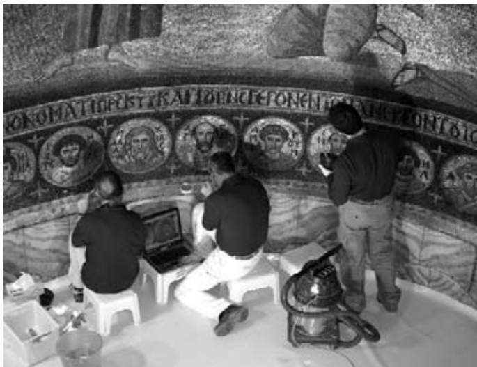
14. General view of the conservators at work on the mosaic of the apse.

The conservation treatment will be long and delicate, but when it is completed in 2007, it will return the mosaic of the Transfiguration - in all its renewed beauty and solemnity - to the monks, the faithful, and visitors.