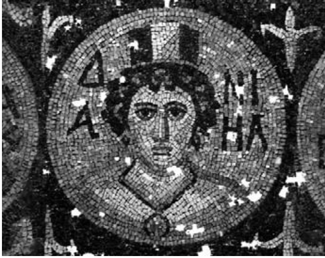
12. A cleaning test showing the missing original tesserae. These areas were filled with white painted gypsum during past restorations.