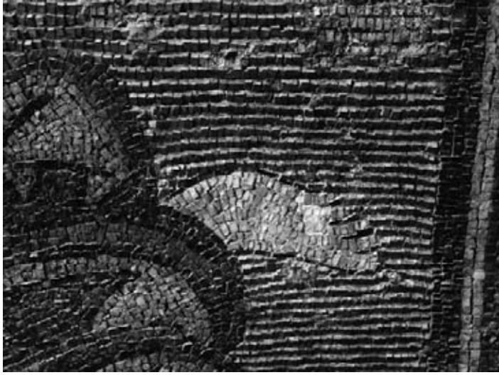
11. The gold and silver leaf tesserae are inserted at an inclination of forty-five degrees.

The components of the first layer were slightly rougher than those of the second layer where the tesserae were to be laid. The principal function of this first layer was to fill the spaces between the blocks in the wall and to form an even preparatory surface for the plaster of the setting bed.