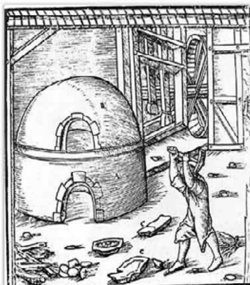
10. Furnace used to produce glass in a sixteenth century representation. (Agricola 1556).

The surfaces of the apse area, constructed with granite blocks, were prepared for applying the tesserae with two layers of mortar made from lime and marble dust.