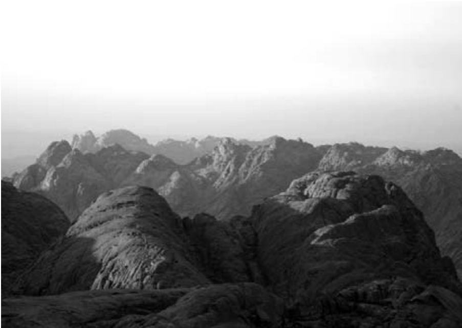
2. The mountain peaks in the Sinai peninsula.